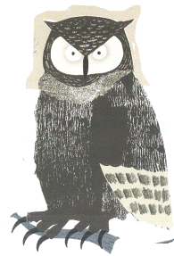
great horned owl